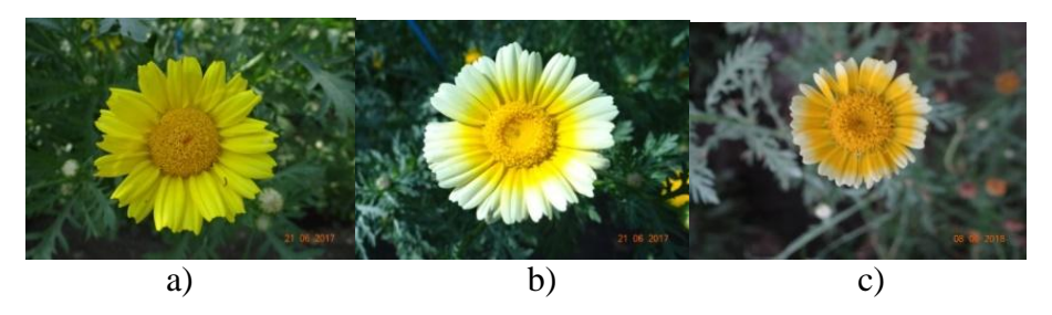
Fig. 1: a) Glebionis coronaria var. coronaria, b) Glebionis coronaria var. discolor, c) Glebionis segetum

The germplasm collection of VRDS Buzau at this species consists of a large number of genotypes belonging to the following varieties: Glebionis coronaria var. coronaria, Glebionis coronaria var. discolour and Glebionis segetum. Only 3 genotypes were bred and genetically stabilized and also showed distinct features (fig.1).